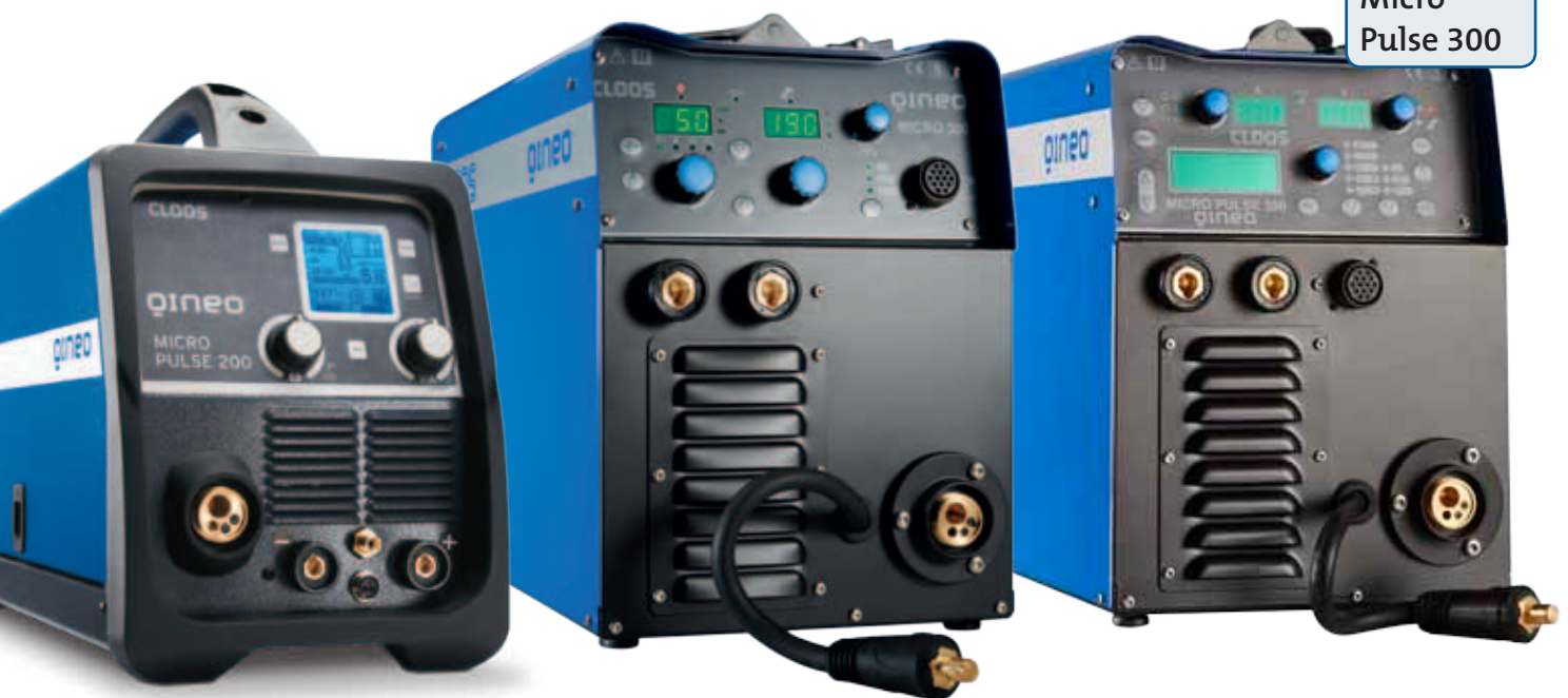
QINEO Micro Pulse 200

Even more power with the Micro Pulse 300