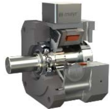
Fig.: mayr® power transmission

ROBA®-topstop® brake systems by mayr® power transmission reliably guarantee the safety of people and materials in gravity-loaded axes.